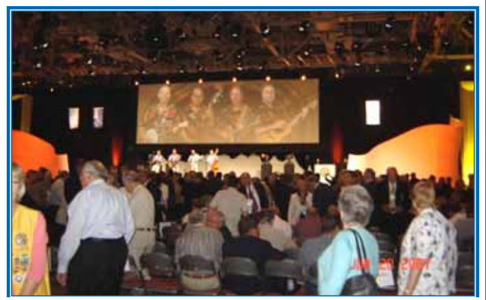
King 'n' Trio performs